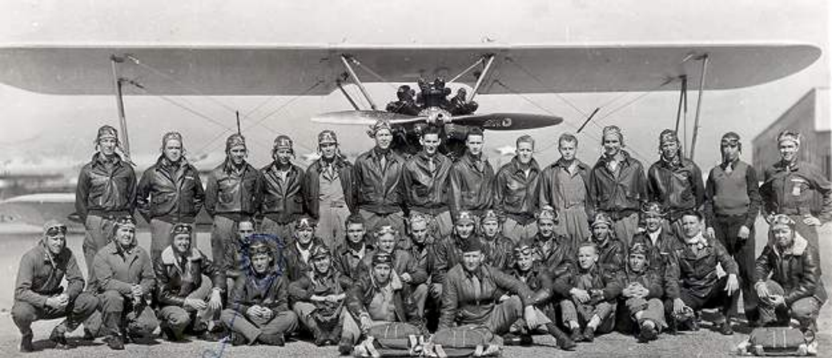
SQD.-E-43-F. 2-9-43. DOUGLAS, GA